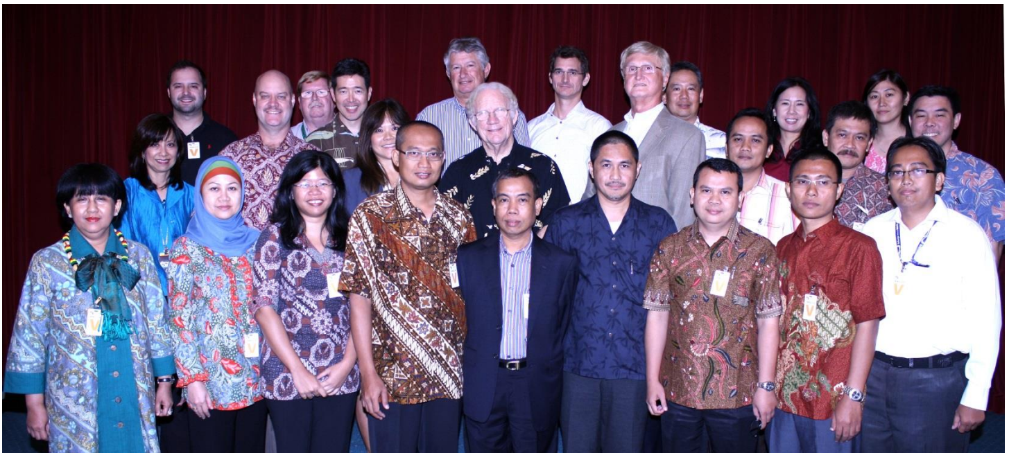
Above: The delegation from PT PLN of Indonesia at Hawaiian Electric Company with HECO, USAID and USEA staff.

In response to rising electricity demand, a distributed population and high and volatile fuel costs, Indonesia has set an aggressive renewable energy development plan, with a goal of 12 GW of new additional renewable energy generation planned by 2020, including solar and wind. With such a high penetration of intermittent renewable resources on isolated island grids, PLN is preparing to face the challenges of maintaining grid stability and reliability. In order to identify best practices in renewable energy integration, PLN delegates met for five days with Hawaiian utilities, regulatory bodies, state energy agencies and energy companies.