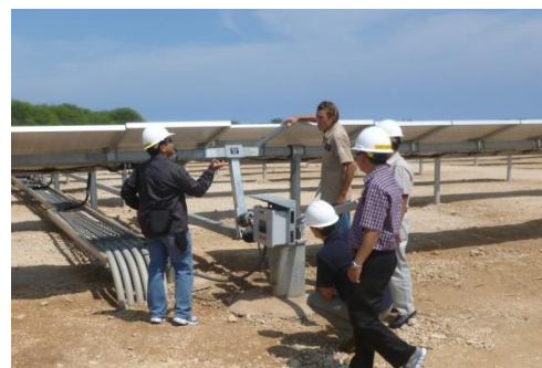
Above: SunPower staff demonstrates the tracking equipment used at the 5 MW Kalaeloa Solar generating station outside of Honolulu.

On Oahu, the PLN delegates toured SunPower’s 5 MW Kalaeloa Solar facility. Kalaeloa I features SunPower’s own solar tracking system, which maximizes production by rotating the photovoltaic panels to track the sun’s movement across the sky. The SunPower staff described the process of developing a solar photovoltaic plant in Hawaii, including the PPA negotiation, interconnection study, and operation of the plant. Solar photovoltaic power has high potential in most of Indonesia due to times of exposure and the strength of Indonesia’s Equatorial sun. Indonesia is also exploring solar facilities with tracking technology.