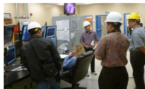
Above: The PLN delegation studies the operations center of the H-Power waste-to-energy power station.

After visiting the biodiesel plant, the PLN delegation toured H-Power’s 73 MW waste-to-energy plant. H-Power combusts municipal solid waste and reduces 90% of the volume of refuse destined for Oahu’s landfill. H-Power staff explained the revenue stream for the project and showcased their latest addition to the plant. The new burner enables H-Power to burn solid waste while reducing the amount of sorting necessary. In the plant operations center, PLN delegates watched a crane operator feeding municipal solid waste into the burner. In addition, operations staff for the plant demonstrated the plant’s operations monitoring equipment in real time.